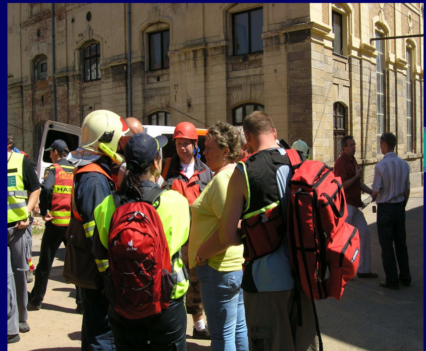
FRS and the psychosocial intervention team – training 6/2010